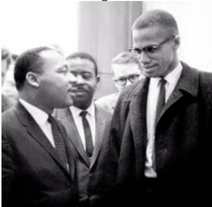
MLK & Malcolm X