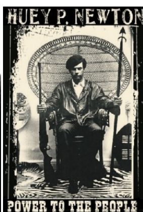
Black Panther Leader