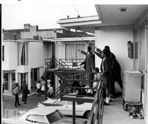
MLK Assassination Site