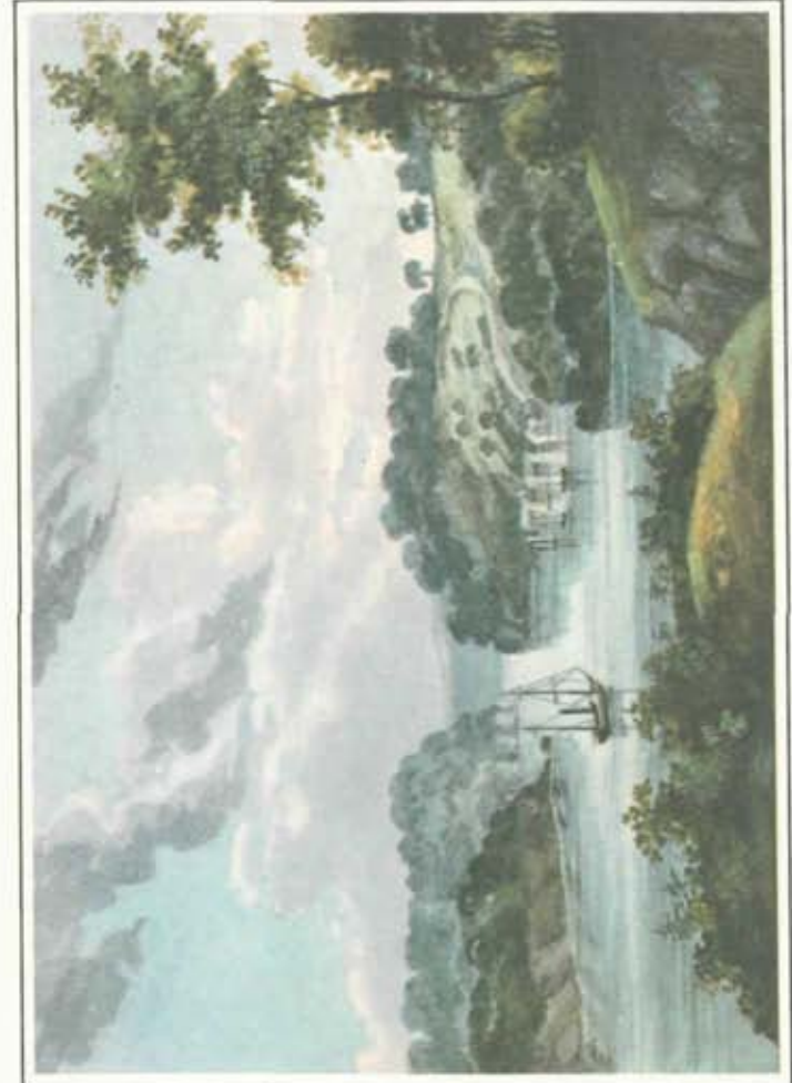
UNIDENTIFIED SCENE, POSSIBLY GENESEE RIVER

van. chariot in centre and baggage waggon: bringing up the rear. "Astonished the natives" and entered Queenston, without meeting with any adventures of moment. excepting throwing a couple of bad pennies to a lame negro. Who would not pick them up. Poor encouragement. to charitable persons. Digression to Benevolent and Philanthropical Tocieties. Compare them to " Churchwarden's stuffing their bellies for the "good of the Goor" - Helps the paupers along a -mazingly. Anecdote of the chimney sweep dining on the effluria from a cook's cellar and decision of the crazy man, that the cost thould be paid by the jingling of money between two em -ply placeers. quite to the purpose. Charitabledinners not quite so frequent in the United States as in England. Quere. What's the rea -son. N. B. Cant tell. Story of the Churchwar.