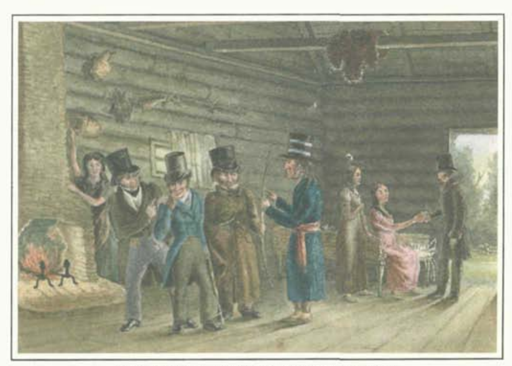
THE SENECA INDIANS, NEAR BUFFALO