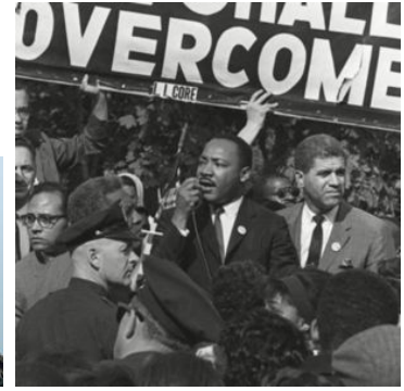
Martin Luther King, Jr. on L.I.