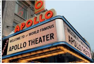
Harlem Living Landmark