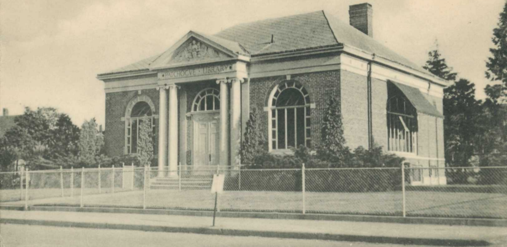
PUBLIC LIBRARY, PATCHOGUE, LONG ISLAND, N.Y.