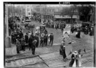
Suffrage Pageant, Mineola, NY