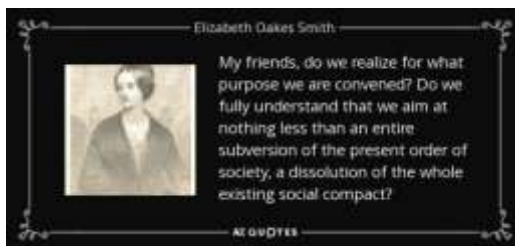
Elizabeth Oakes Smith 1860s U.S. Presidential & V-P. Candidate