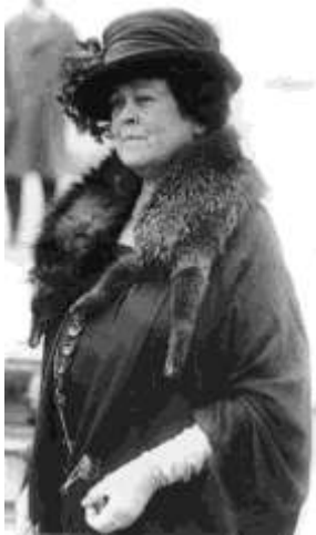
Alva Vanderbilt Belmont