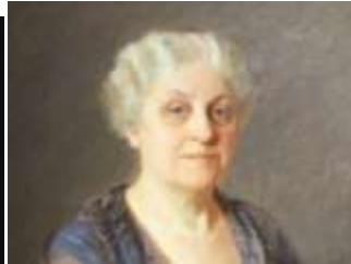
Carrie Chatman Catt