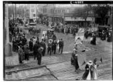
Suffrage Pageant, Mineola, NY