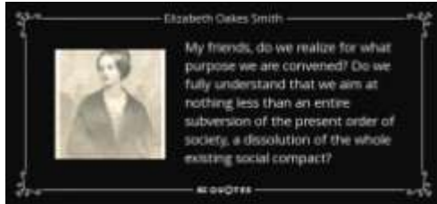
Elizabeth Oakes Smith

Club Rooms, where Carrie Chatman Catt, chair, of Empire State Committee, presided and spoke.