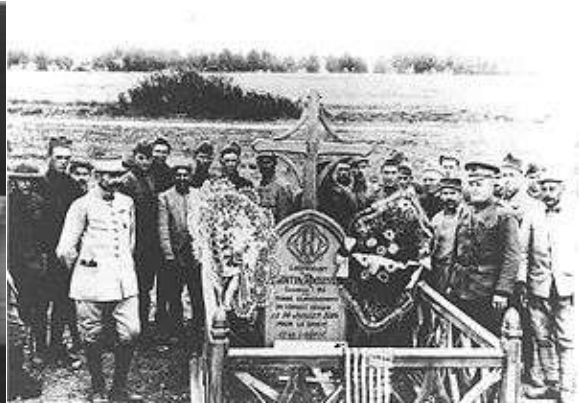
Roosevelt's son Quentin's grave, died in air combat. His favorite son's death destroyed Theodore's spirit.