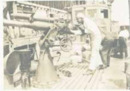
Naval Participant at Unprotected Gun