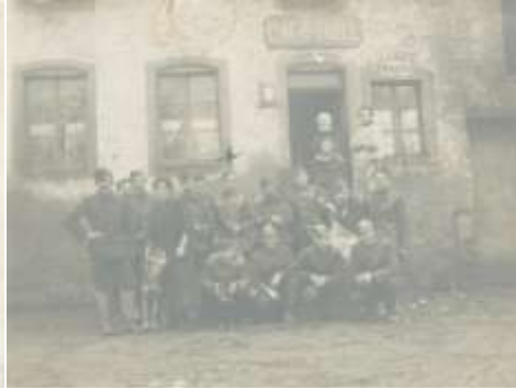
Post-Armistice Multi-National Photo Including Former Enemies, Luxemburg