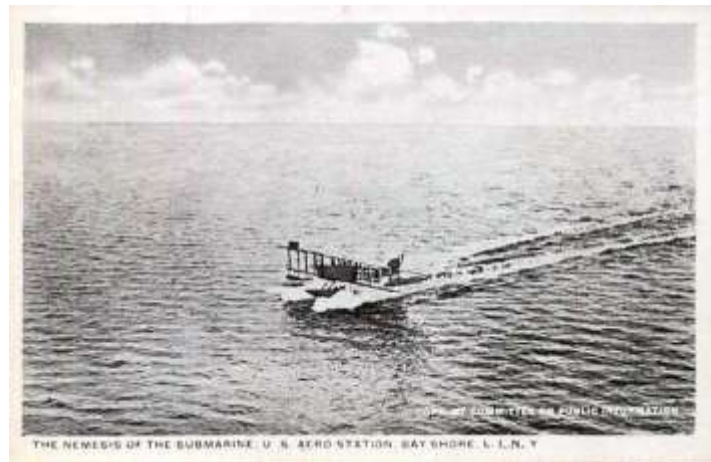
Aircraft from Naval Air Station Bay Shore patrolled offshore for U-boats