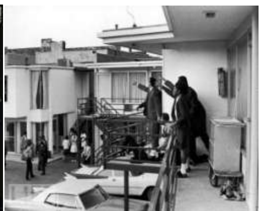
MLK Assassination Site