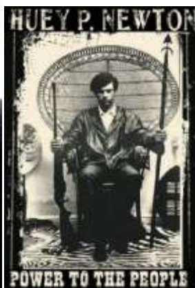
Black Panther Leader