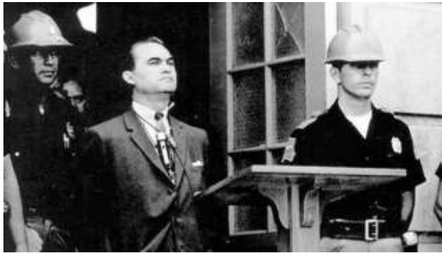
Gov. George Wallace