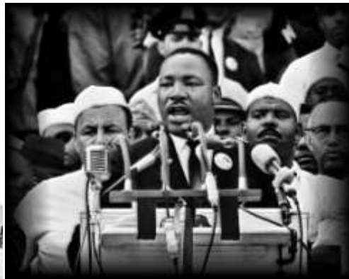
Martin Luther King