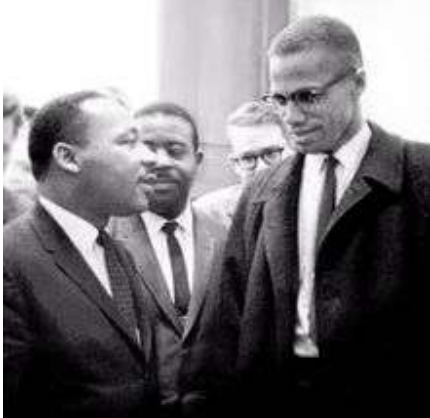
MLK & Malcolm X