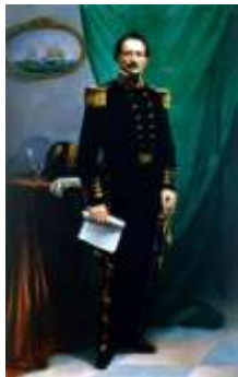
Capt. Uriah P. Levy Outlawed flogging in U.S. Navy, saved Jefferson’s Monticello