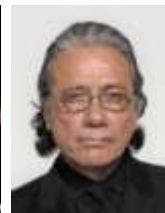
Edward James Olmos, Actor