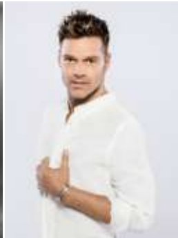
Ricky Martin Famous Singer