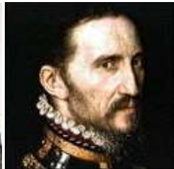
J. Vasquez de Coronado American Southeast