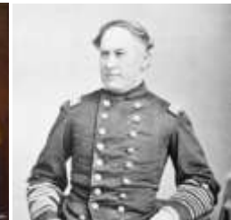
Adm. David Farragut New Orleans, Mobile Bay U.S. Civil War