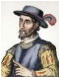
Ponce de Leon Discovered Florida