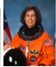
Ellen Ochoa NASA Astronaut