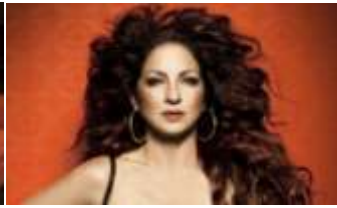
Gloria Estefan Renowned Singers