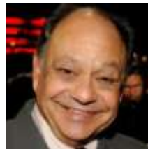
Cheech Marin Comedian