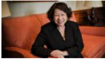
Sonia Sotomayor U.S. Supreme Court Justice