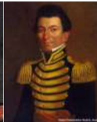
Juan Seguín Texas Independence