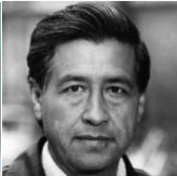
Caesar Chavez Agricultural Workers Union Activist, Reformer