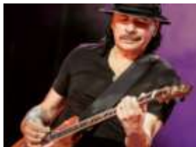
Carlos Santana Musician