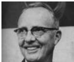
Luis Walter Alvarez Nobel Prize in Physics