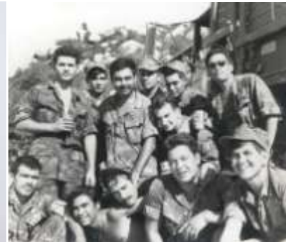
U.S. Hispanic American Soldiers Yesterday, Today, Tomorrow