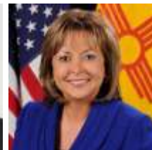
Susana Martinez Governor, New Mexico