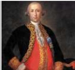
Bernardo de Galves American Revolution